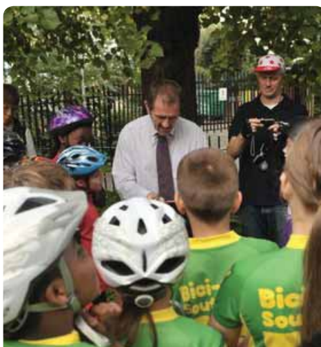
Southwold Primary at ‘Springfield Climb’