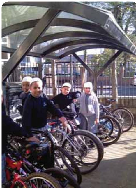
Pupils arriving for Bikers' Breakfast - Tawhid Boys School