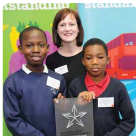
St John the Baptist CE Primary School receiving Higher Standards Award 2010