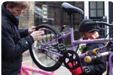
Dr Bike at Daubeney Primary School

To download an application form go to www.hackney.gov.uk/stp or call 0208 356 8469 to request a copy. The deadline for spring term applications is Friday 28 January .