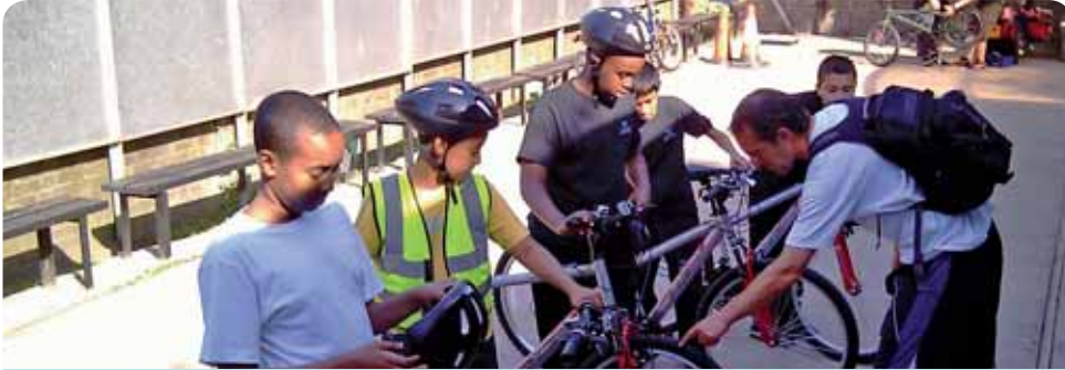
Dr Bike at Tawhid Boys School