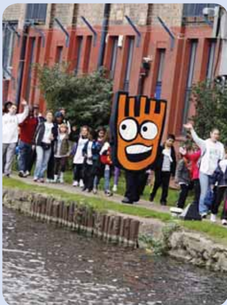
Hackney's Big WoW Olympic Walk

To see more photos of The Big WoW event, join the WoW scheme or download the Big WoW Lesson Plans go to www.hackney.gov.uk/stp