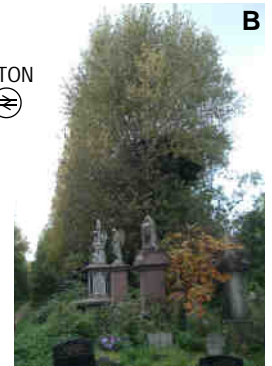
Headstones, angels and an urn, dwarfed by an avenue of Lombardy Poplars.