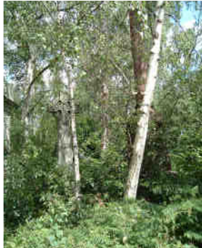
Silver birch and bracken fern are typical plants of dry heath.

The habitats in Abney Park Cemetery support a rich diversity of creatures, plants and fungi. A nationally-rare habitat is dry heath – on the sandy brickearth between Church Street entrance and the Chapel.