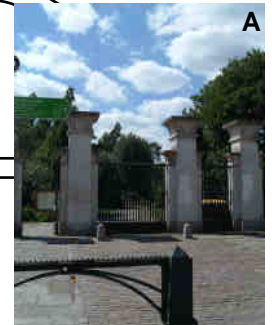
Stamford Hill forecourt, and gates to Entrance Drive.