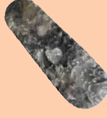
Museum of London

10000BC The Hackney of today is covered in forests, marshes and flowing streams. Archeologists excavating the Olympic site have discovered evidence of an Iron Age Settlement which tells us that people were already living in Hackney 3,000 years ago!