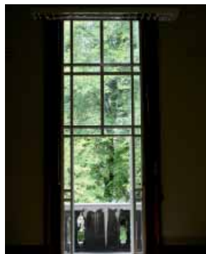
View from the Ceremonial Reception Room