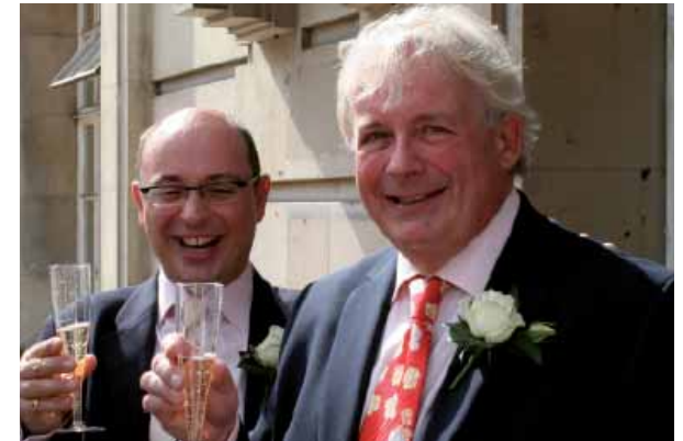
Christopher Biggins recently got hitched in Hackney

Please contact the Event Management Team for more information: Tel: 020 8356 5505 stokenewingtonvenuehire@hackney.gov.uk www.hackney.gov.uk